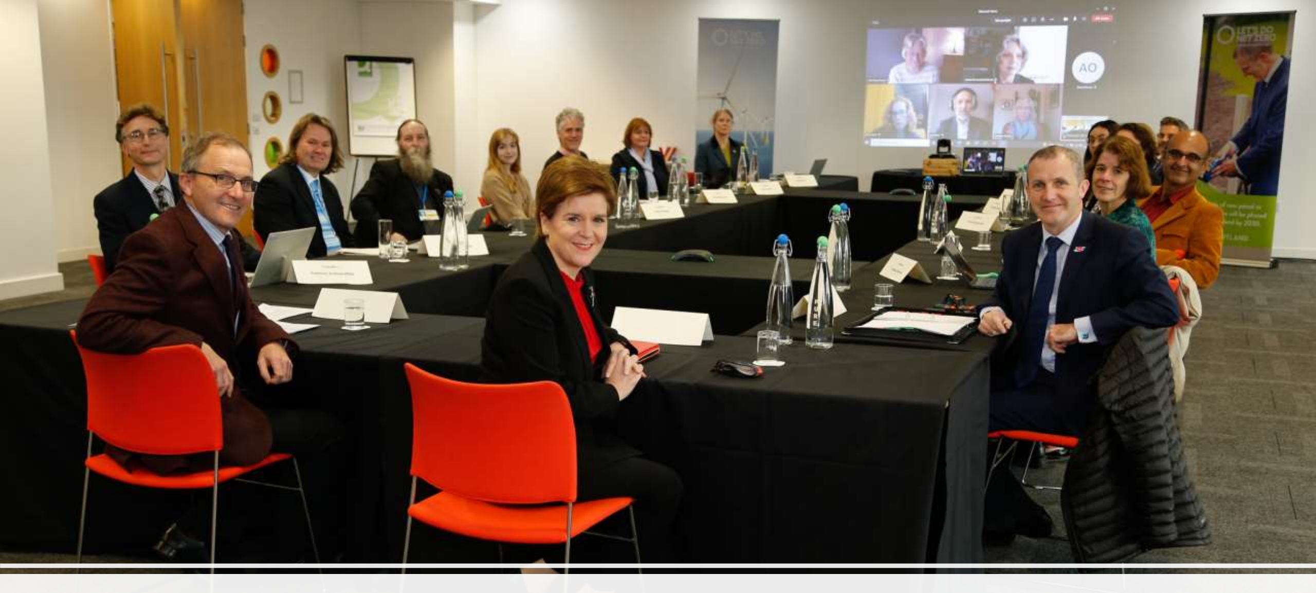
Meeting of the First Minister's Environment Council