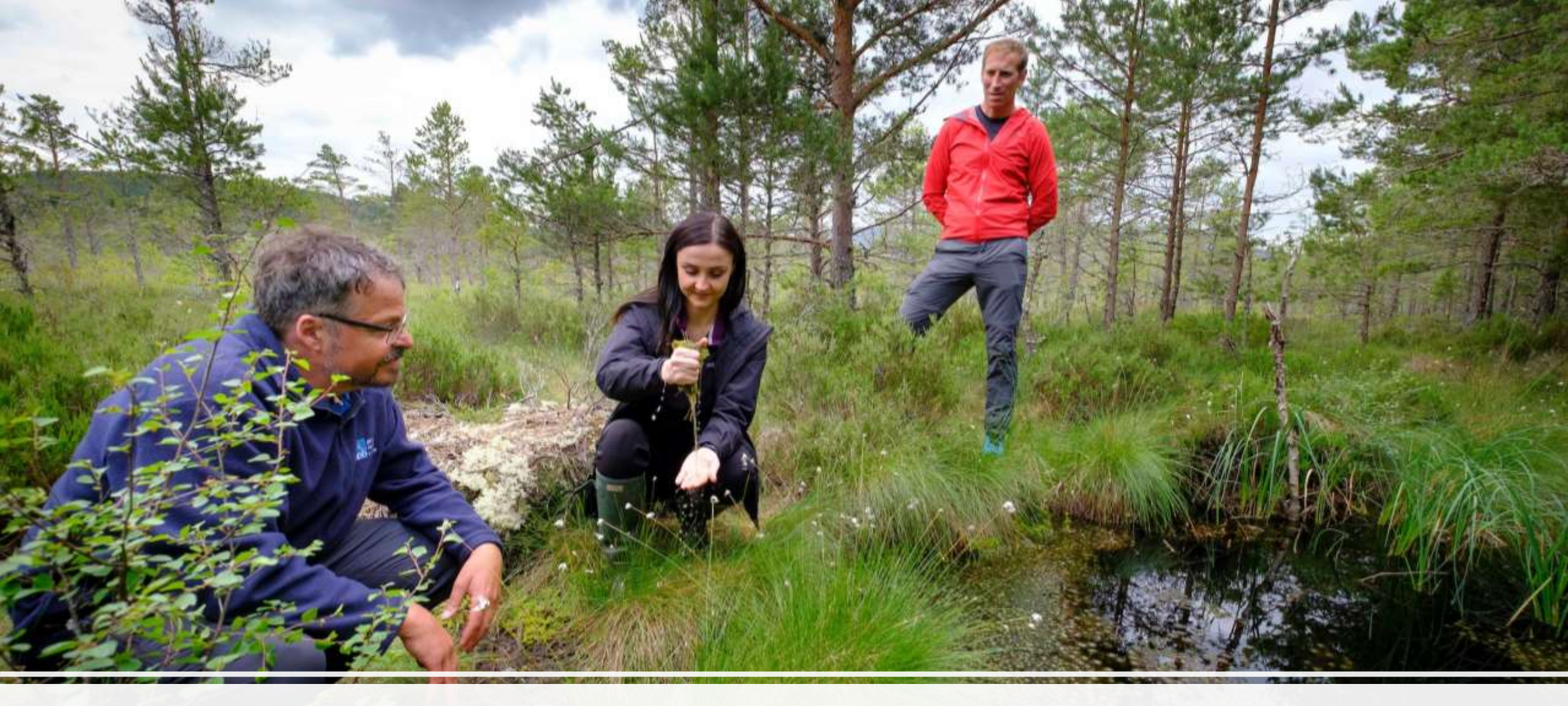
Peatland Restoration is key to achieving Net Zero