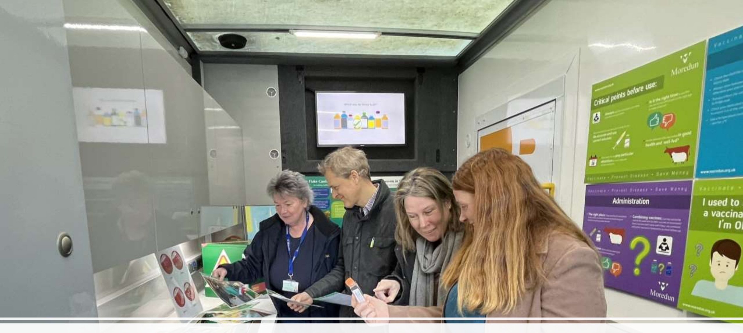
Strengthening links with research organisations