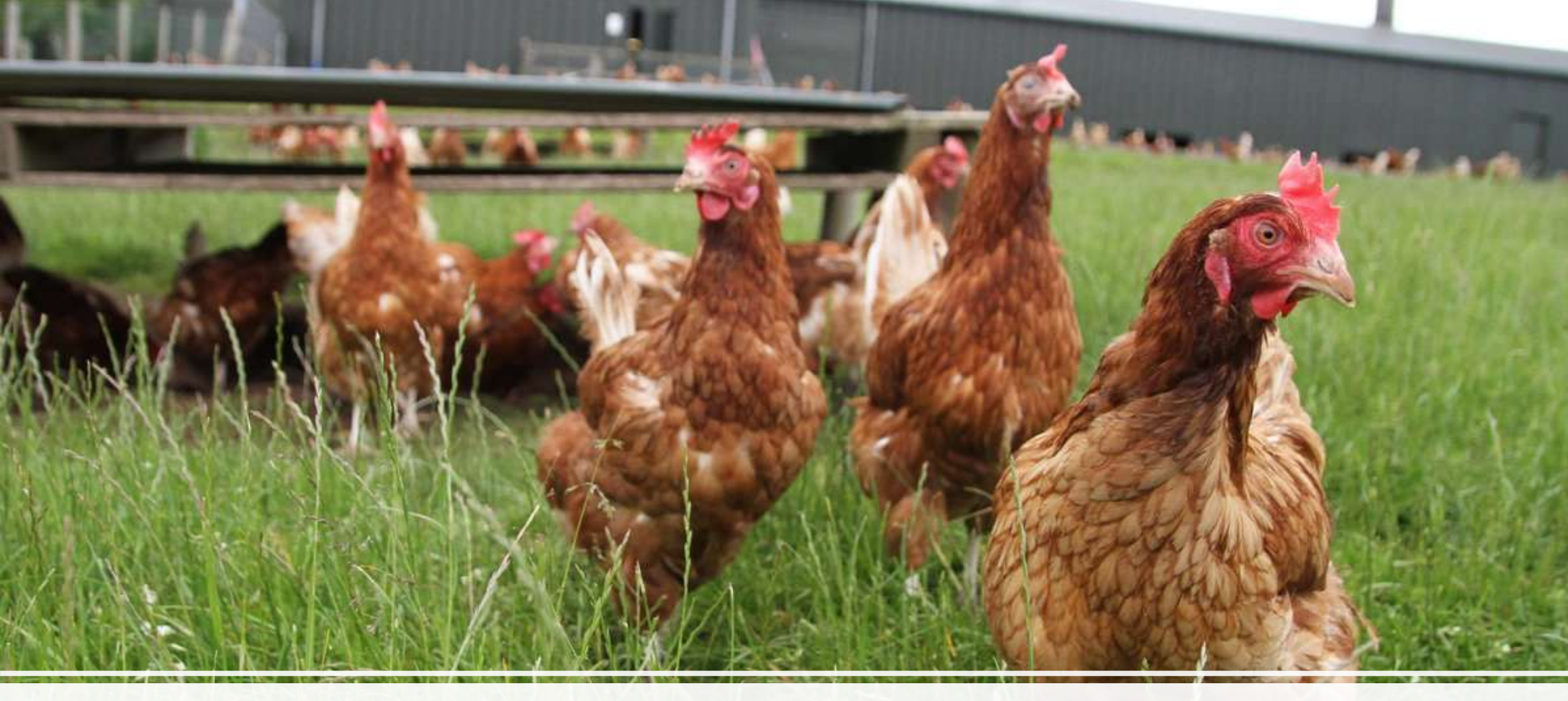
Informing future agricultural policy