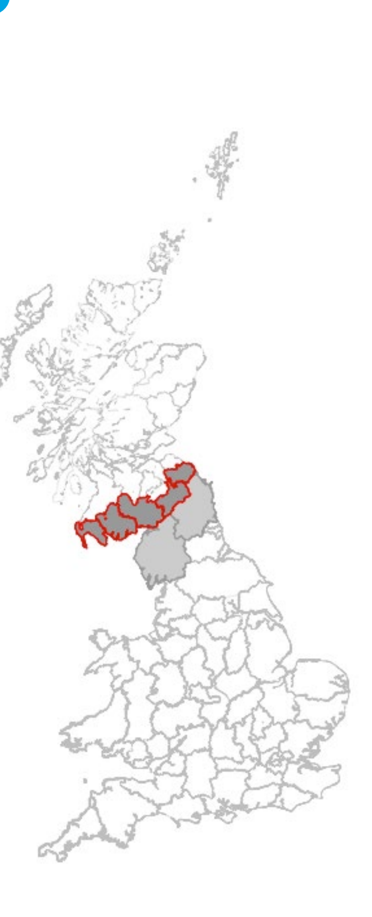
Fig. 1. The 3 snap-out